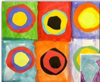
KANDINSKY'S CIRCLES Kindergarten