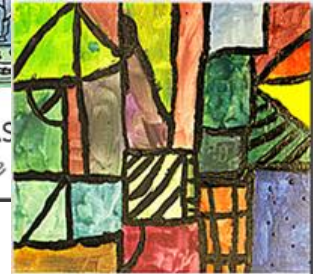
KLEE ABSTRACT PAINTING Fifth Grade