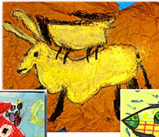
CAVE ART Second Grade