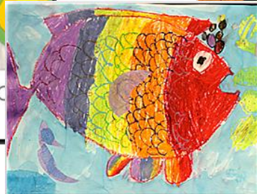
MISTER FISH First Grade