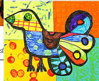
BRITTO MIXED-MEDIA Third Grade