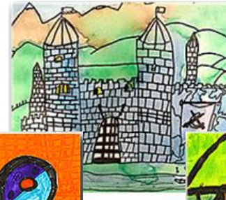
M.C. ESCHER'S FOUR COLOR CASTLE Fourth Grade