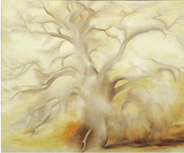
Winter Tree III, 1953, Georgia O’Keeffe

The goal of this 5 th grade lesson was to blend soft pastels in dark and light values to create branches on a tree with a three-dimensional appearance.