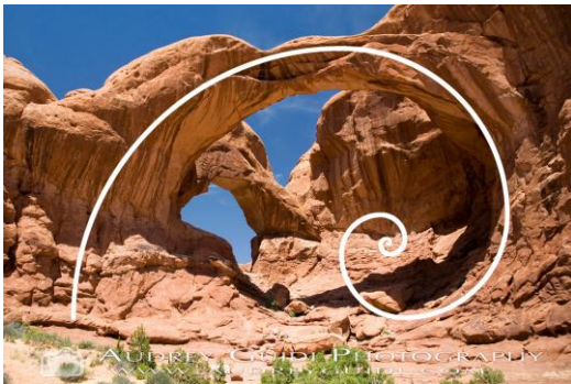
Arches National Park, Utah