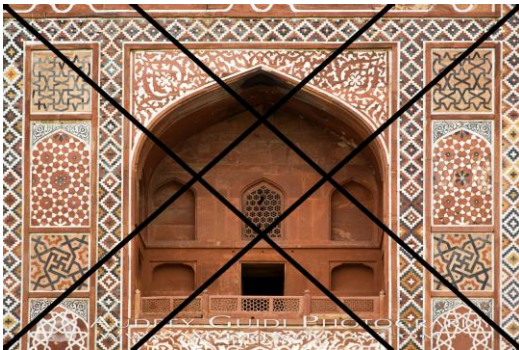
Tomb of Akbar the Great, Agra, India