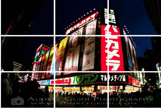
Yodobashi Camera, Tokyo, Japan

The goal of this 5 th grade lesson was to compare three common rules of composition in photography and art and to help students explore ways to arrange shapes in space.