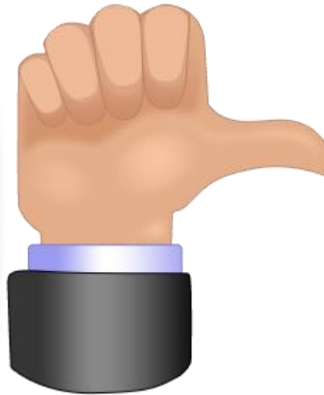
Support with reservations