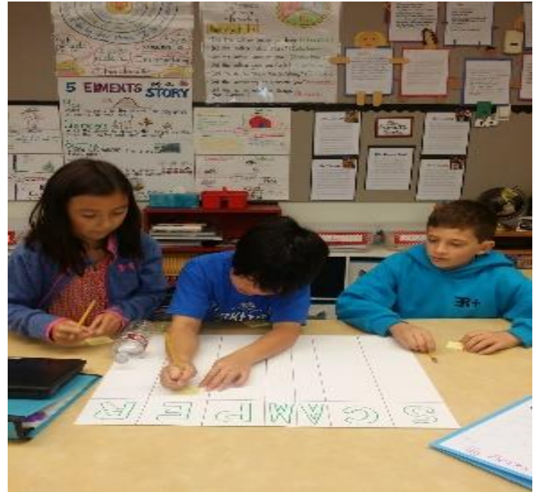
Pull-Out Quest students use a brainstorming strategy to identify "What can you do with a plastic water bottle?"