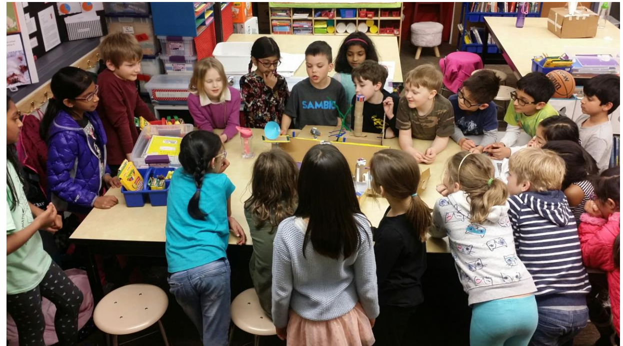
Pull-Out Quest students working on an engineering design challenge.