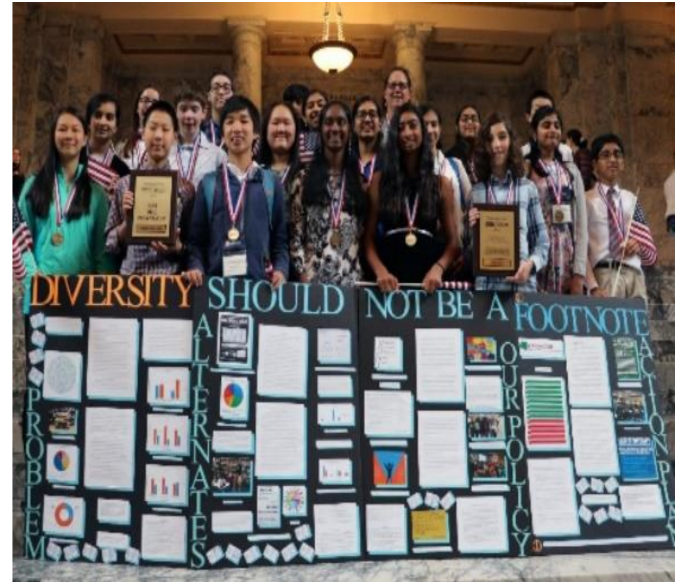
Evergreen Quest students participate in "Project Citizen" at the Capitol.