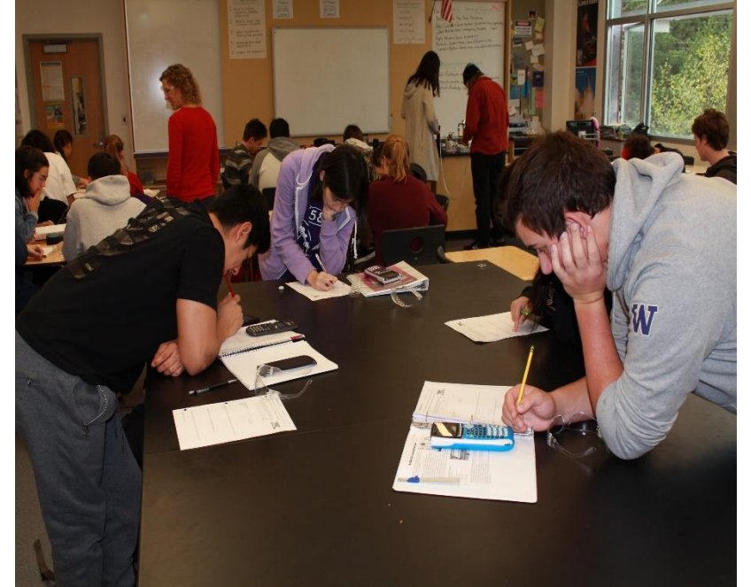
Students in an AP Physics class