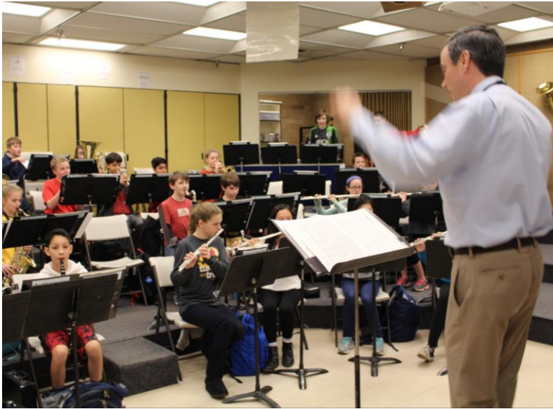
Band at Kamiakin Middle School