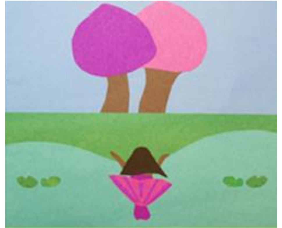
3rd grade composition project from Audubon Elementary