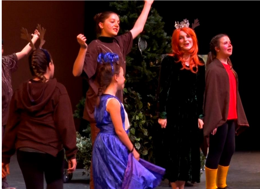
Drama production at Renaissance School of Art and Reasoning