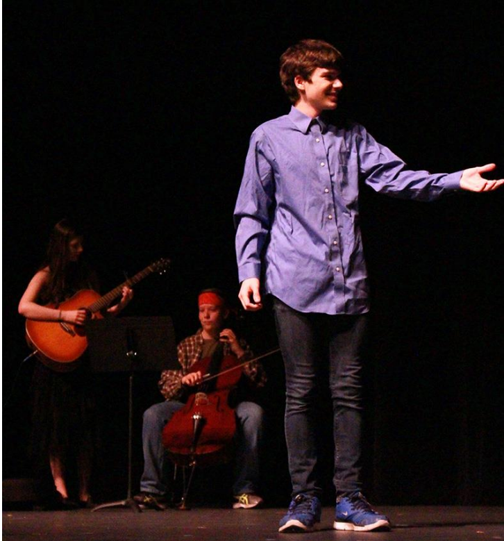
Redmond High School Drama Fest