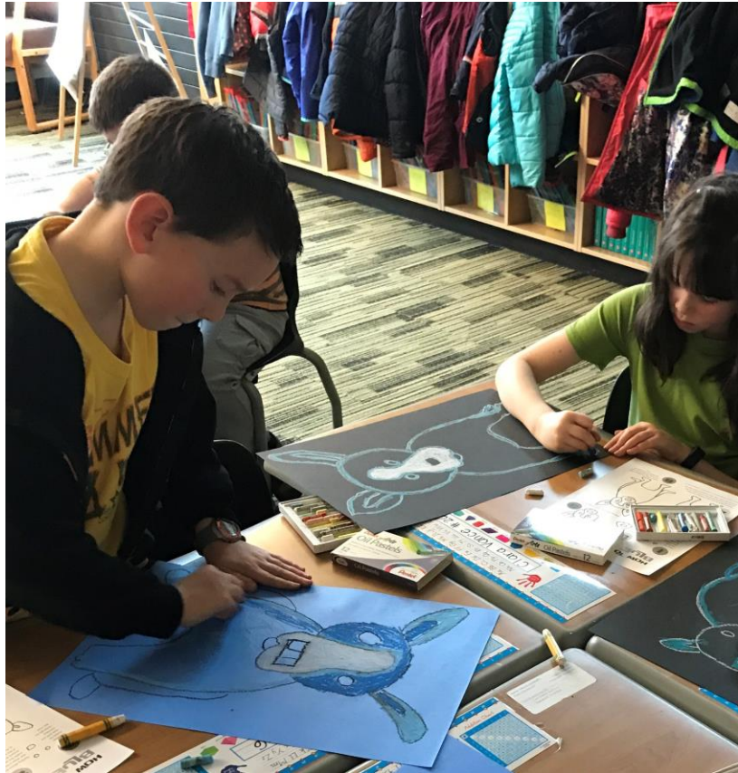
2 nd Grade Art Projects at Rush Elementary