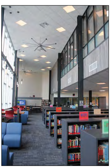
The first phase of Juanita High School opened for students and staff in September 2019. The library, Performing Arts Center, commons and some instructional spaces are complete. An additional instructional wing will open in September 2020. To see more photos and videos, visit: <a href="www.lwsd.org/jhs-rebuild">www.lwsd.org/jhs-rebuild</a>.