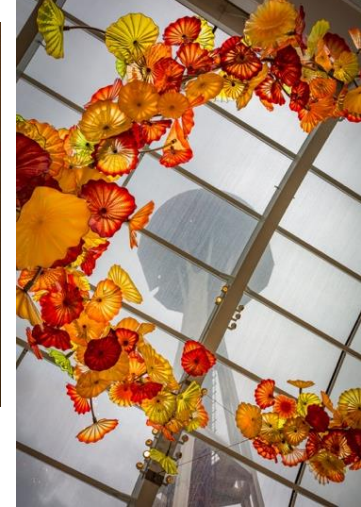
Macchia displayed at the Chihuly Garden and Glass Museum in Seattle