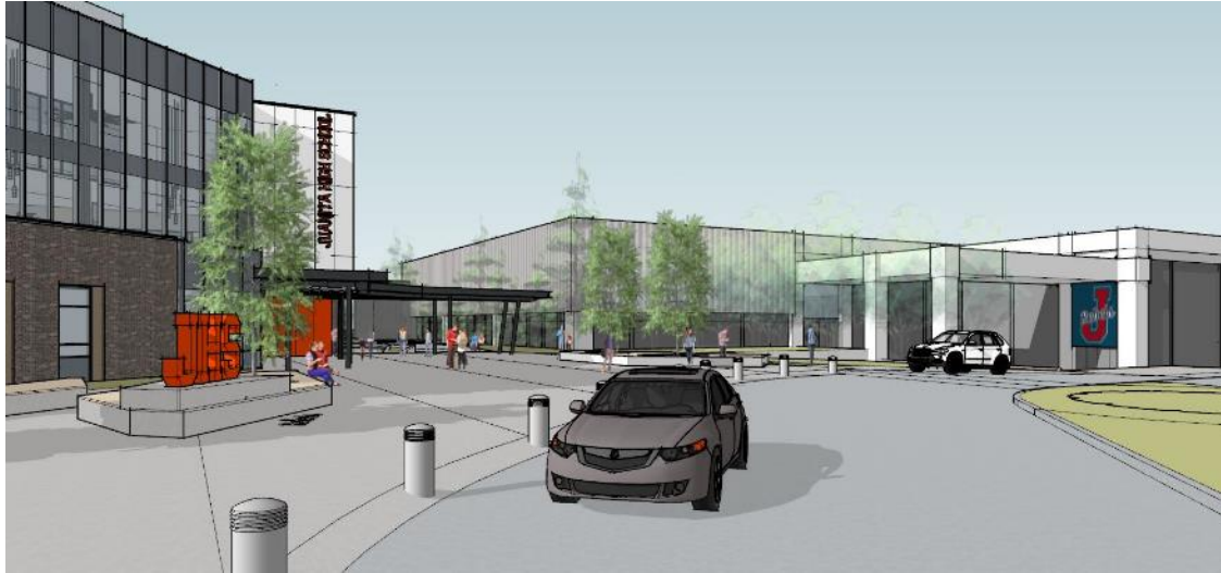
Front Entry View