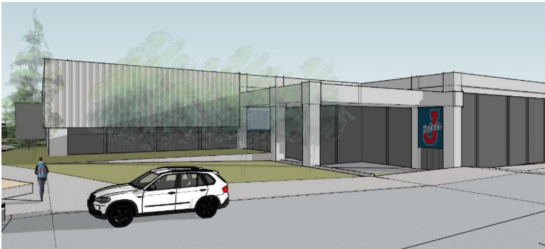
Field House / Pool North Entries