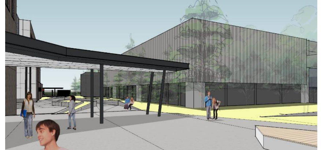
View towards Athletic Fields