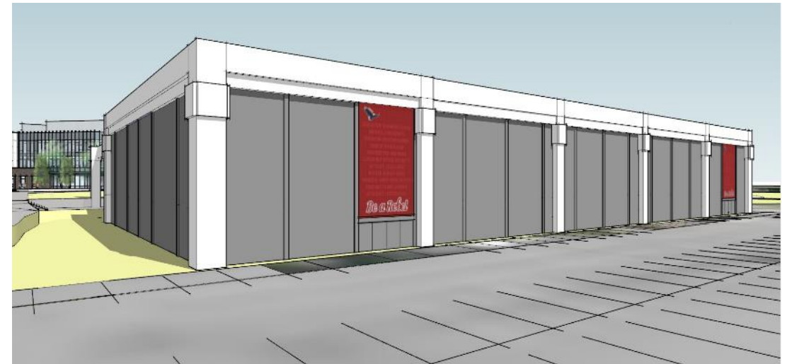
Field House West side