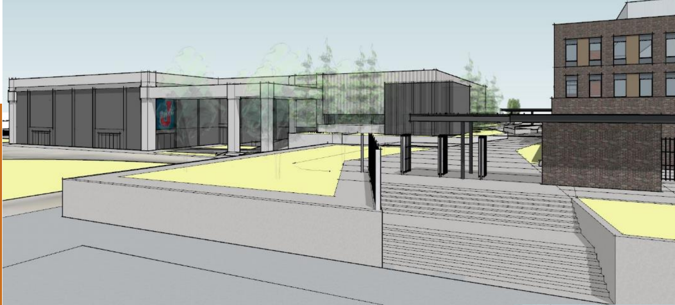
View towards Main Site Entry