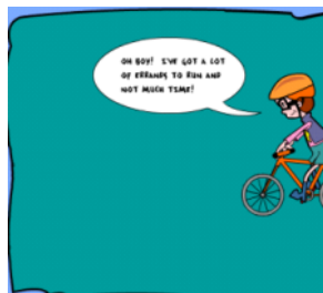
Cyberchase . Games . Bike Route | PBS Kids http://pbskids.org/cyberchase/websiteside/3/web_game3.htm Screen clipping taken: 4/16/2010, 11:04 AM