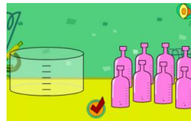
Invisible Ape http://www.compasslearningodyssey.com/sample_act/12math_in_visoape.html Screen clipping taken: 4/16/2010, 11:48 AM