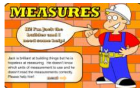
Measures http://www.bqfl.org/bqfl/custom/resources/ftp/client_ftp/ks2/maths/measures/index.htm Screen clipping taken: 4/16/2010, 1:35 PM