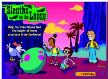
Cyberchase . Games . Sleuths on the Loose | PBS Kids http://pbskids.org/cyberchase/games/bodymath/bodymath.html Screen clipping taken: 4/16/2010, 11:01 AM