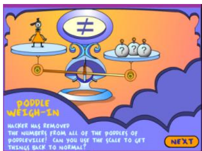
Cyberchase . Games . Maze & Marbles | PBS Kids http://pbskids.org/cyberchase/games/algebra/ Screen clipping taken: 4/16/2010, 11:36 AM