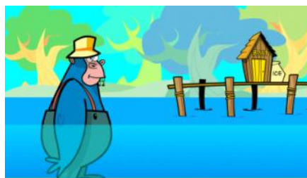
http://www.compasslearningodyssey.com/sample_act/math1_2/01MADB03a-fish_tails_v2.swf Screen clipping taken: 4/16/2010, 11:40 AM