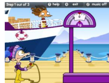
http://www.bbc.co.uk/schools/ks1bitesize/numeracy/measurements/index.shtml Screen clipping taken: 5/2/2011, 12:17 PM