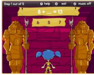
BBC - KS1 Bitesize Games - Numeracy - Addition and Subtraction http://www.bbc.co.uk/schools/ks1bitesize/numeracy/numbers/index.shtml Screen clipping taken: 5/2/2011, 12:14 PM