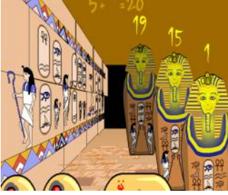
funkymum20 http://www.ictgames.com/funkymum20.html Screen clipping taken: 8/25/2011 12:36 PM Advanced- Missing Number