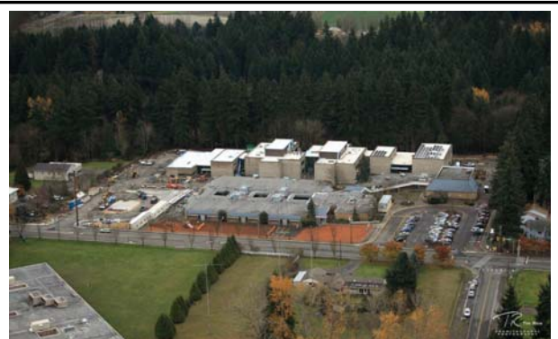
Aerial of our new school

Please bring the following items with you: - Proof of child's birth date - Child's Immunization records - Emergency contacts - and for all-day kindergarten, a money order or check for one month's tuition. Full tuition for all day kindergarten is $330.00 (subject to change).