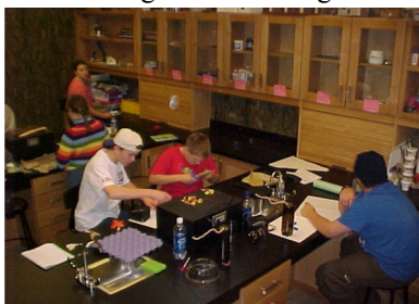
State-of-the-art science lab