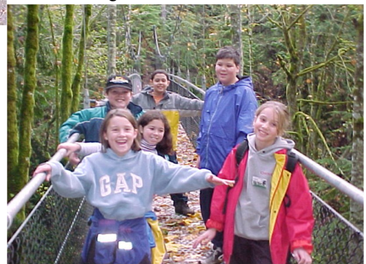
The suspension bridge doesn't scare them!