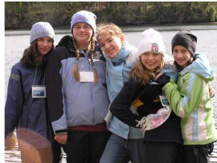
Building new friendships