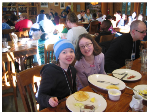
The Dining Hall—one of our favorite places!