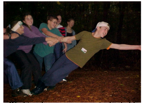
Working the teams course - in the dark!