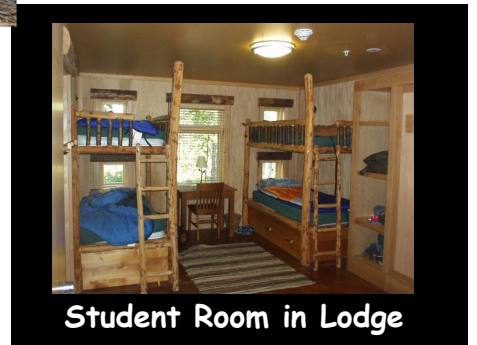
Student Room in Lodge