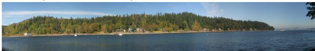
Wonderful Blakely Harbor