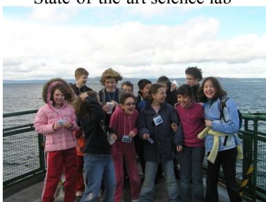
Getting there on the ferry is half the fun!