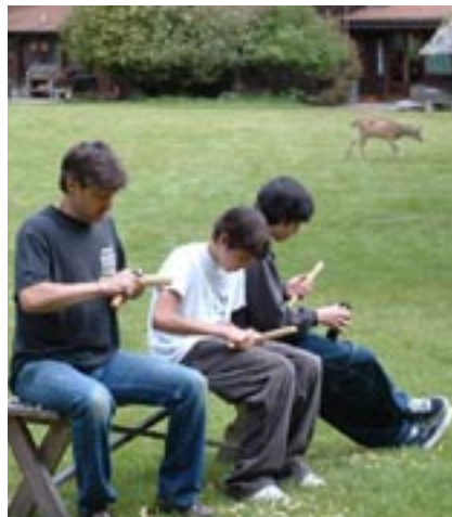
ICS students carving beaters for their drums.