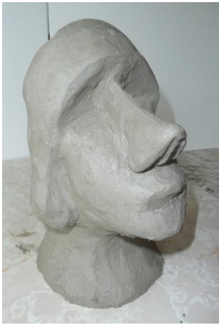
Moai of Easter Island