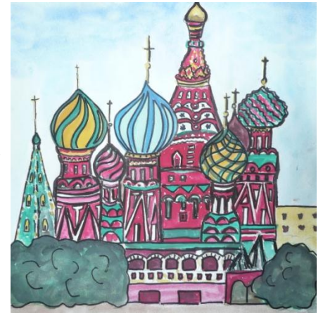
Moscow's Red Square

We will integrate one point perspective and disappearing points. We will capture reflections, sky and clouds, water, sunset, shades, and light. We will use pencils, charcoals, soft pastels, oil pastels, watercolor, acrylic on canvas, and 3D sculpture from clay.