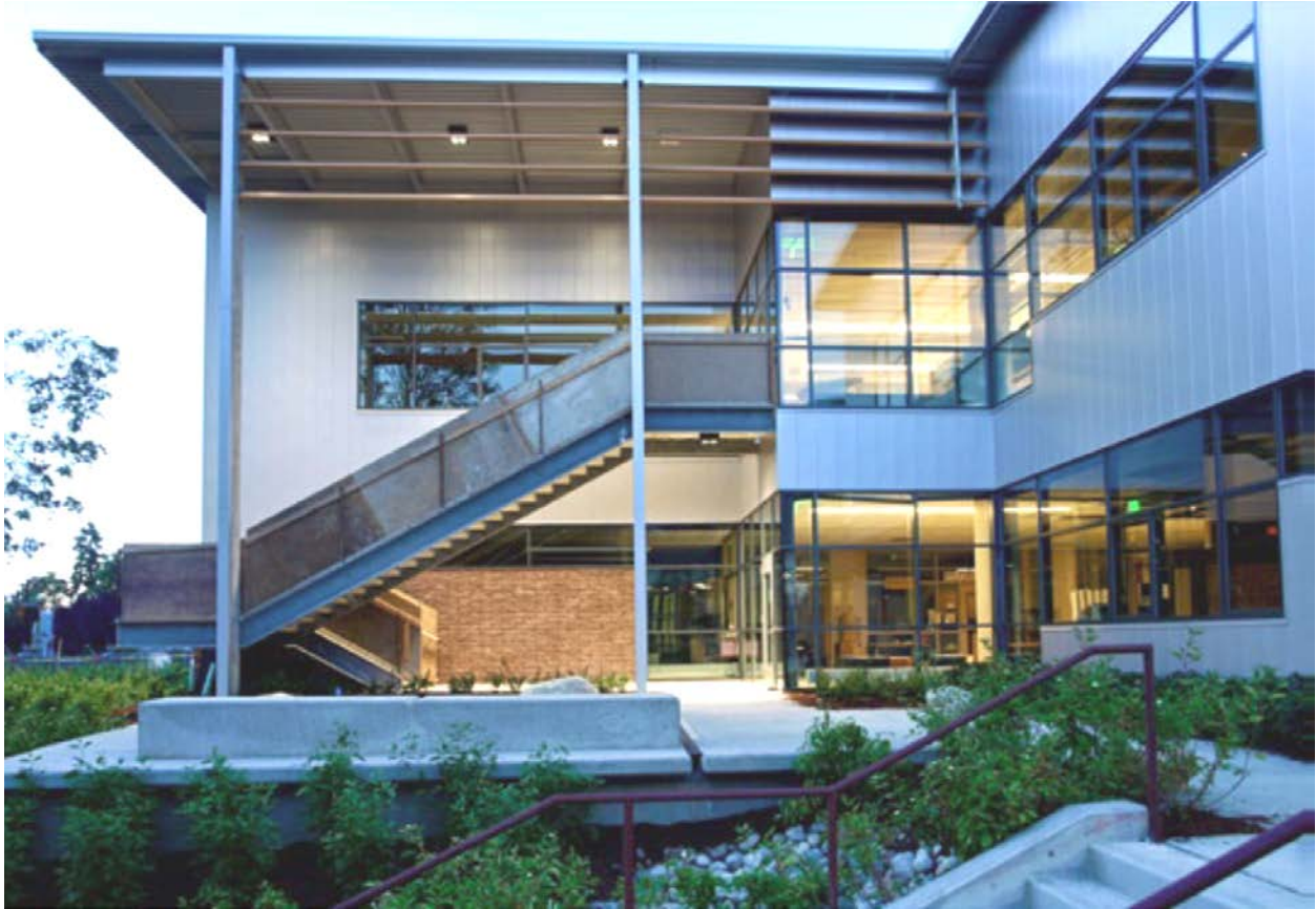
Carl Sandburg Elementary