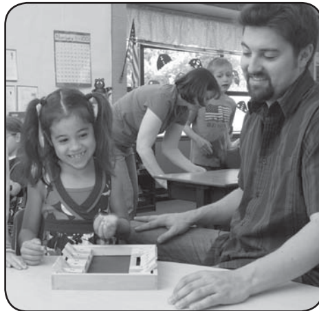
Pictured above: Family Math Night at Sandburg Elementary.

Lake Washington PTSA Council Website: www.lwsd.org/ptsa Phone: 425-936-1216