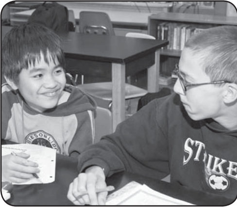
Table of Contents | Information for parents/guardians

This booklet contains important information for parents to start the school year. The district is legally required to provide some of this information. We also have included some important information that may be helpful to you. This information supplements the parent information that will be provided by your student's school. If you have questions on this information, call (425) 936-1200 and you will be connected to the appropriate department.